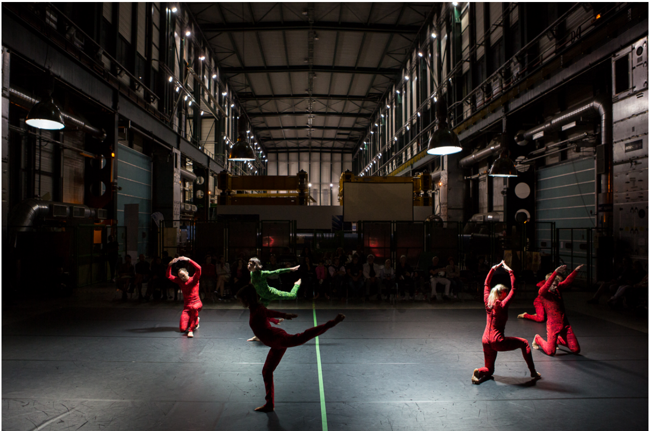
General view CERN-CMS during show