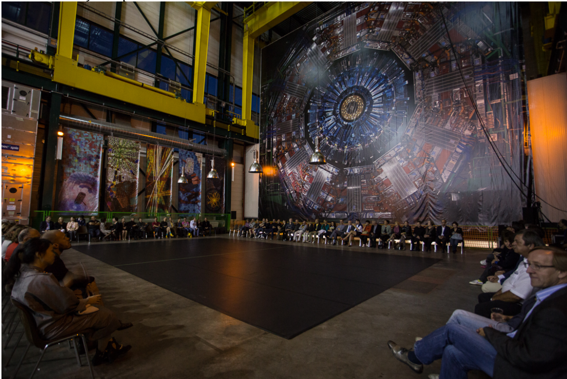
Stage and audience : CERN-CMS