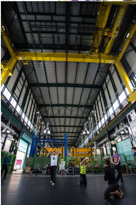
Hanging points and grid at CERN-CMS